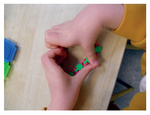
Figure 1: From parent - "[Child] wanted to show this heart that he made and was extremely proud of. He said 'I love school and teacher'.