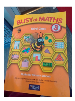
Figure 2. Primary school maths' books came up as a common image of a challenge.