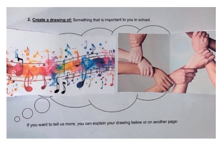
Figure 4. A collage made by a student depicting something of importance to them in school.